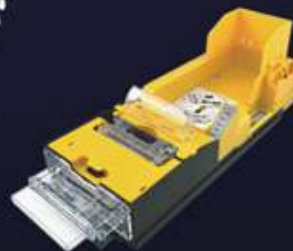
Barcode Thermal Printer