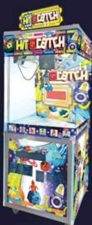
Hit and Catch