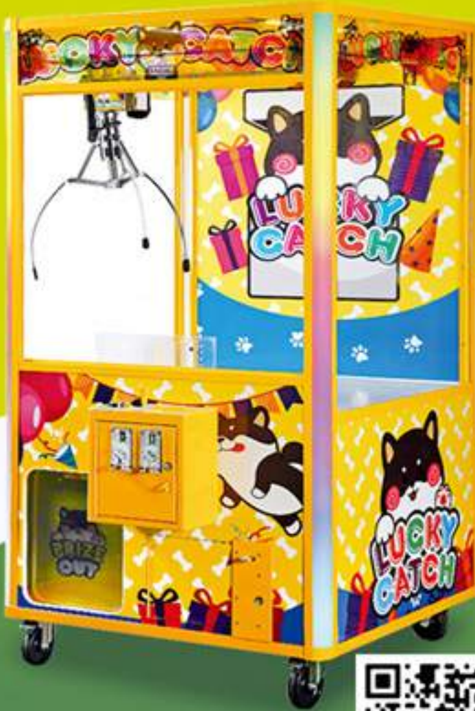
KJB series W132xD123xH232cm