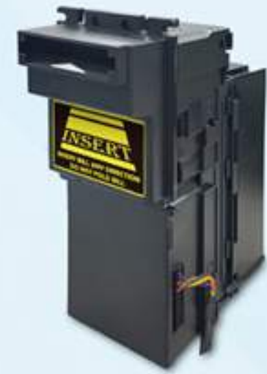
U72 MDB bill acceptor for vending machines