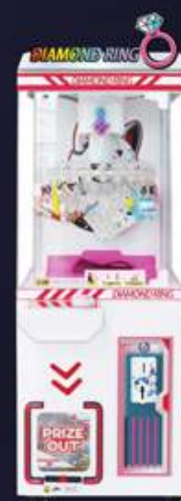
Clip Prize Machine