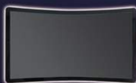
Curved Touch Monitor 32" - 43"