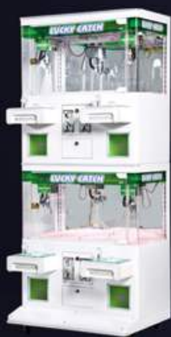
4in1 Claw Crane