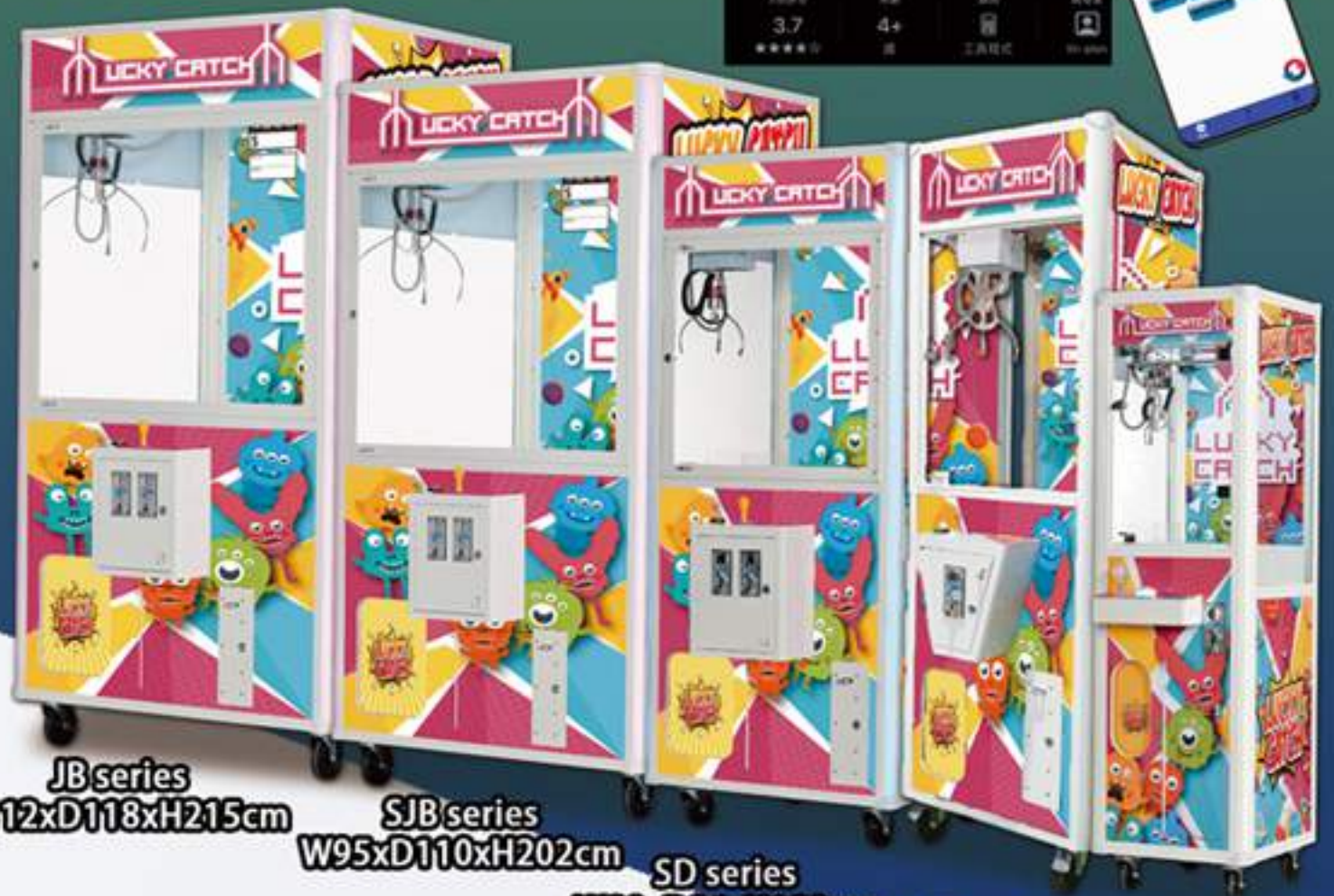
JB series W112xD118xH215cm

Cut Resistant Complete Security STRONGEST EVER Online Problem Solving Auto Repair System on Stuck Coins and Paper