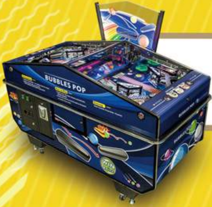
Coin-operated Amusement Game