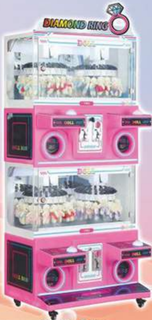
4P Clip Prize Machine