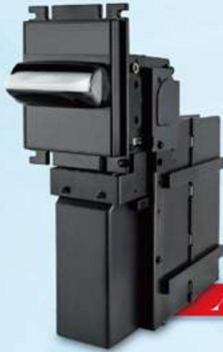
BRP70 Bill Acceptor (Use with FBP66)