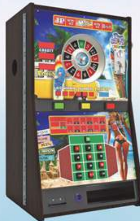
Roulette -Pro Surf