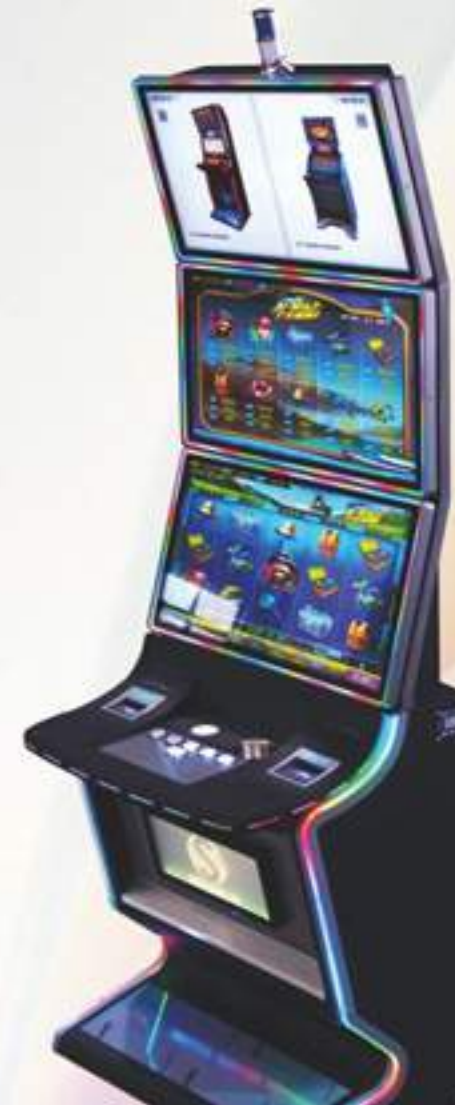
MCFM-65 triple 32