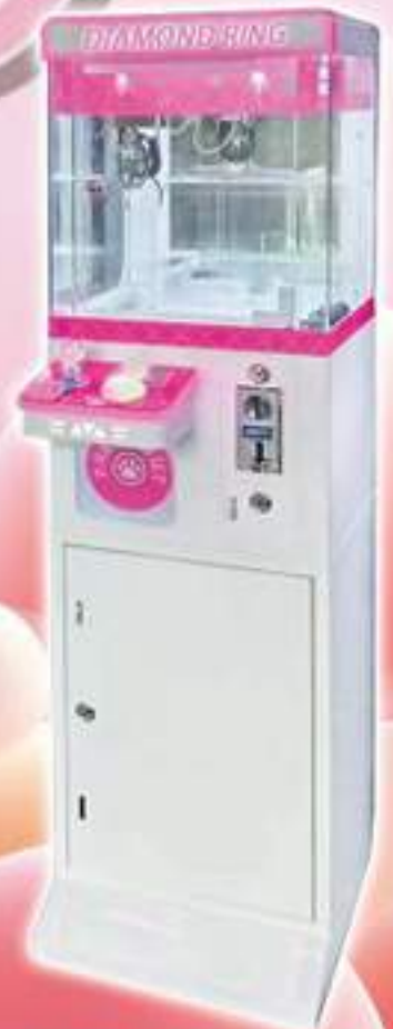
Single Mini Claw Machine