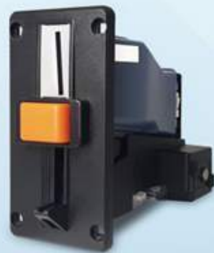
UCAES Coin Acceptor