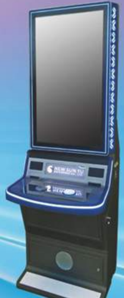
MCFM-55 LCD:43" ~ 49"