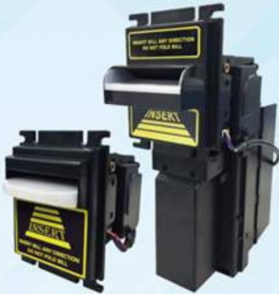
TP series Bill Acceptor