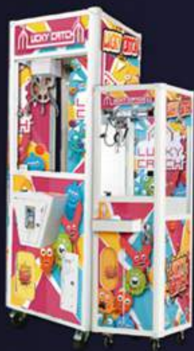
Mini Claw Crane