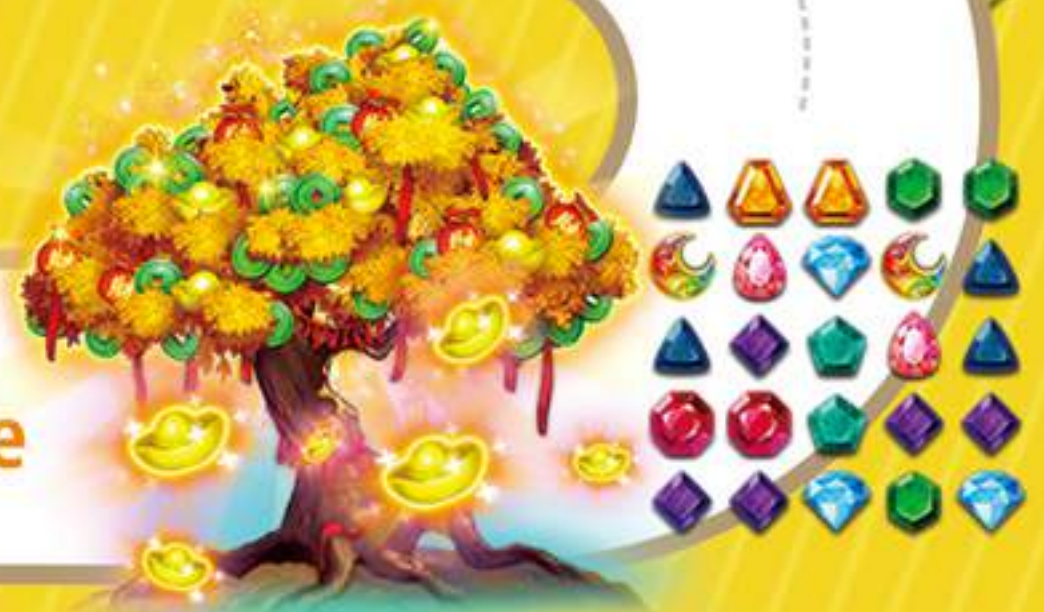
Fish Shooting Game