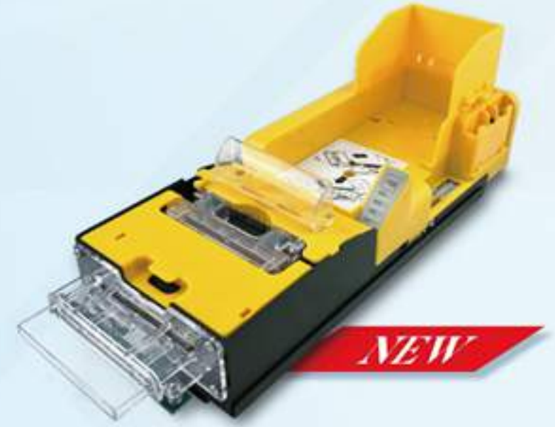
FBP66 Thermal Printer