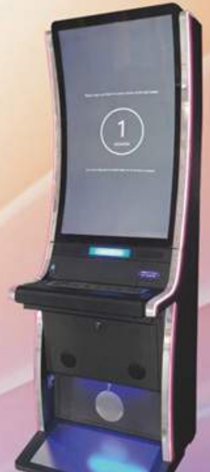
MCFM-51 LCD:43" CURVE