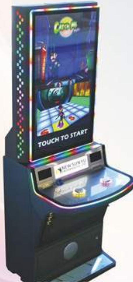
MCFM-55 43" ~ 49"