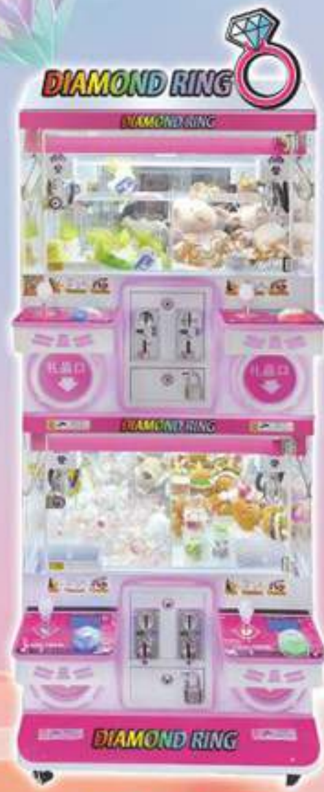
4P Mini Claw Machine