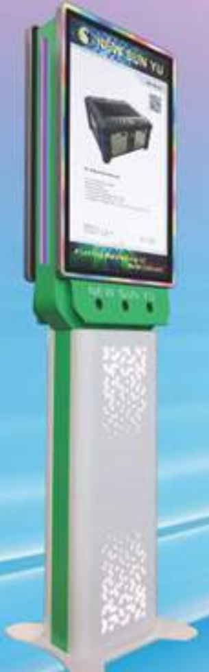
Double 32inch kiosk for ICE