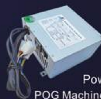
Power Supply POG Machine