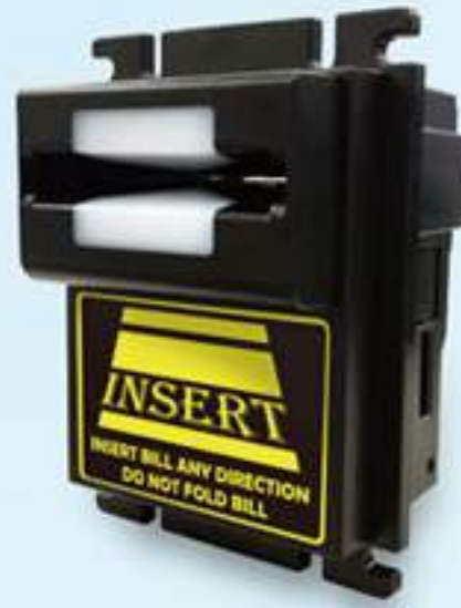
TB74 Bill Acceptor