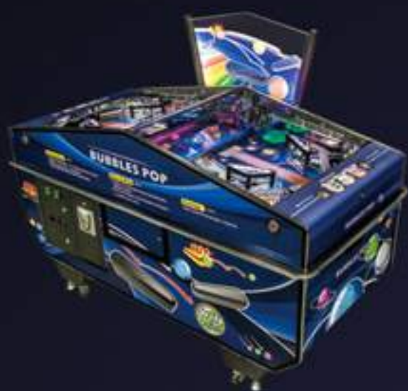
Bubbles POP Head to Head Arcade Game