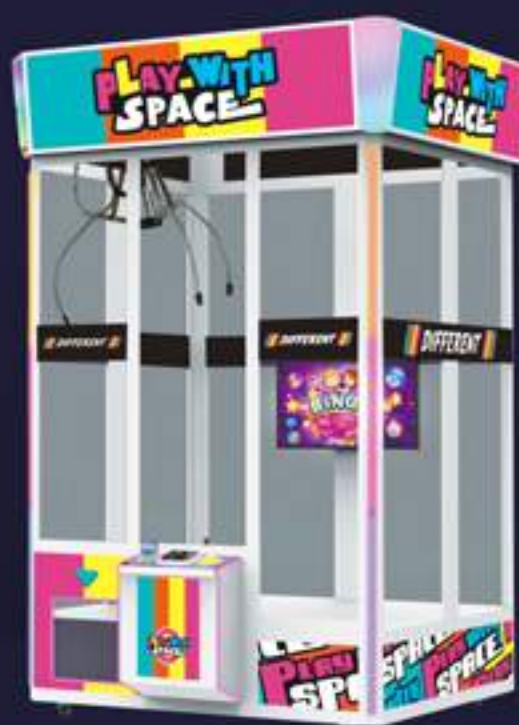
Play With Space