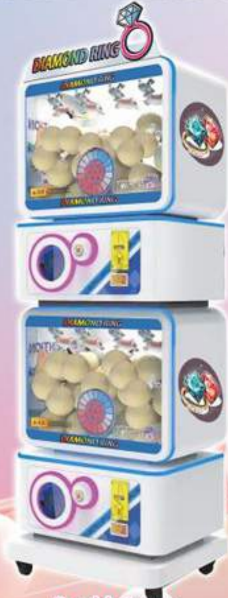
Double Layer Gashapon Machine