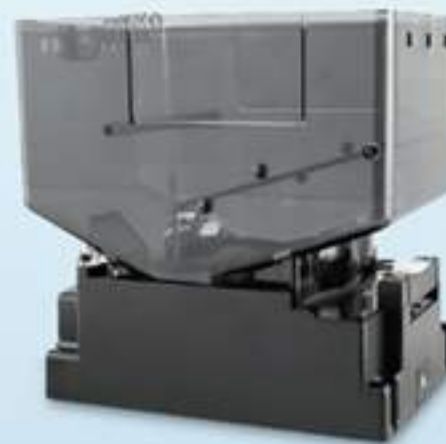
Mini Hopper Coin Dispenser