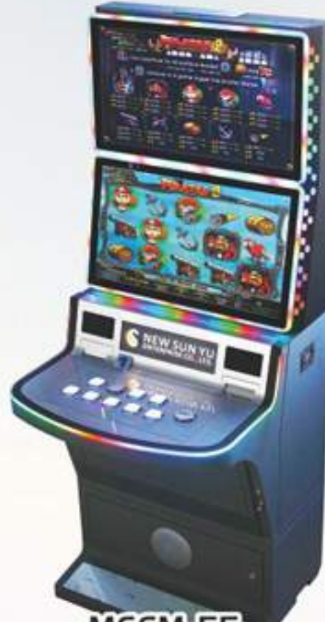
MCFM-55 Double 27