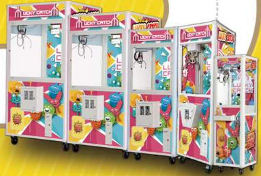
Claw Crane Machine