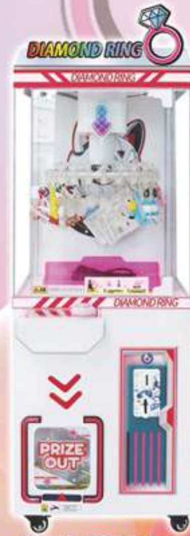
Single Clip Prize Machine