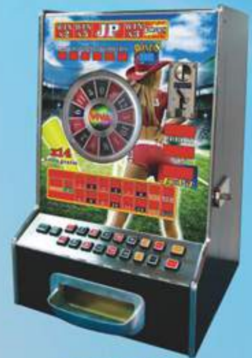
BGFM-13 SUPER SPIN