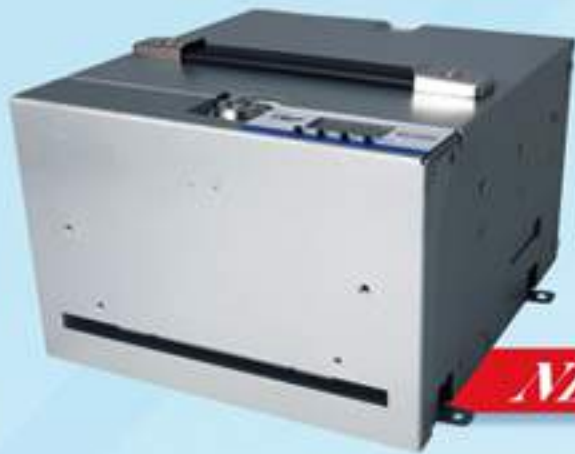
XC200 Note Dispenser